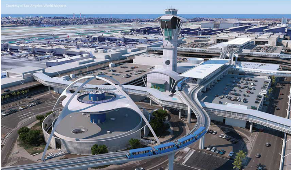
LAX's new people-mover system is being designed around existing parking structures.

HDR has been tapped to lead design of the Los Angeles International Airport automated people mover as a member of the LAX Integrated Express Solutions (LINXS) P3 team. HDR will lead designs for fixed facilities for the automated people mover system, with an estimated design and construction value of $1.95 billion.